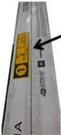
Carton top surface

1) Set-up Guide can be found inside top carton flap: