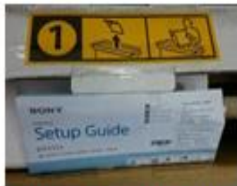
Set-up Guide taped to top inside tab

2) Pinch and Pull all 4 plastic joints to remove carton and safely remove the TV from tray: